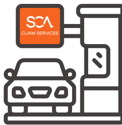
Drive-In Inspection Centers