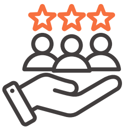
Specially Trained Team

We’re working smarter to deliver the nation’s premier hail claims management solution, and we look forward to partnering with you!